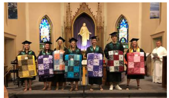
Right: Seniors each received a quilt made by the RLCW Quilters.